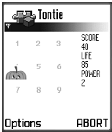
Fig. 1. Screen Capture of the BT Tontie

Figure 1 shows the user interface of the BT Tontie game captured on the Nokia mobile phone. Multiple monsters could be probabilistically generated and then displayed at any of the 9 available cells. At the same time, any of the players can hit at any displayed monster to score with the instant updates performed on the whole multi-player community across the wireless network.