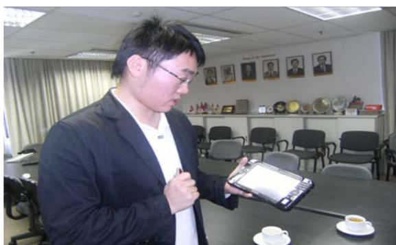
Fig 1 – A Demonstration of our COMPAD-PRO Simulator on the UMPC

The recent advance in pen-based computing and mobile devices empowers many innovative e-learning systems with increased interactivity and improved features. In this paper, we proposed an innovative and pen-based COMPAD simulator to enhance both education and research in computer systems. Being model-based, our proposal is adaptive and different from many commercially available Windows-based emulators that are customized for specific computer architectures. Besides, our COMPAD simulator allows learners to flexibly modify any part of a program through pen-based inputs, and instantly visualize about the computed results. In this way, the COMPAD simulator can support not only education but also research such as instruction scheduling in computer systems. To demonstrate the feasibility, we built the COMPAD-PRO as its prototype for empirical evaluation. After all, this work stimulates many interesting directions for further exploration.